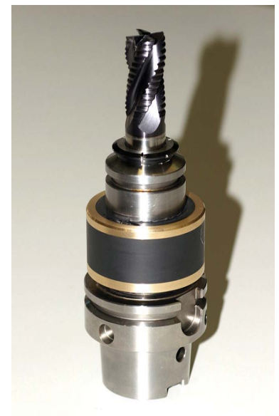
Intelligent tool holder with integrated sensors