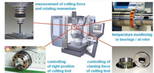
Wireless sensor systems for condition and process monitoring at a rotating spindle